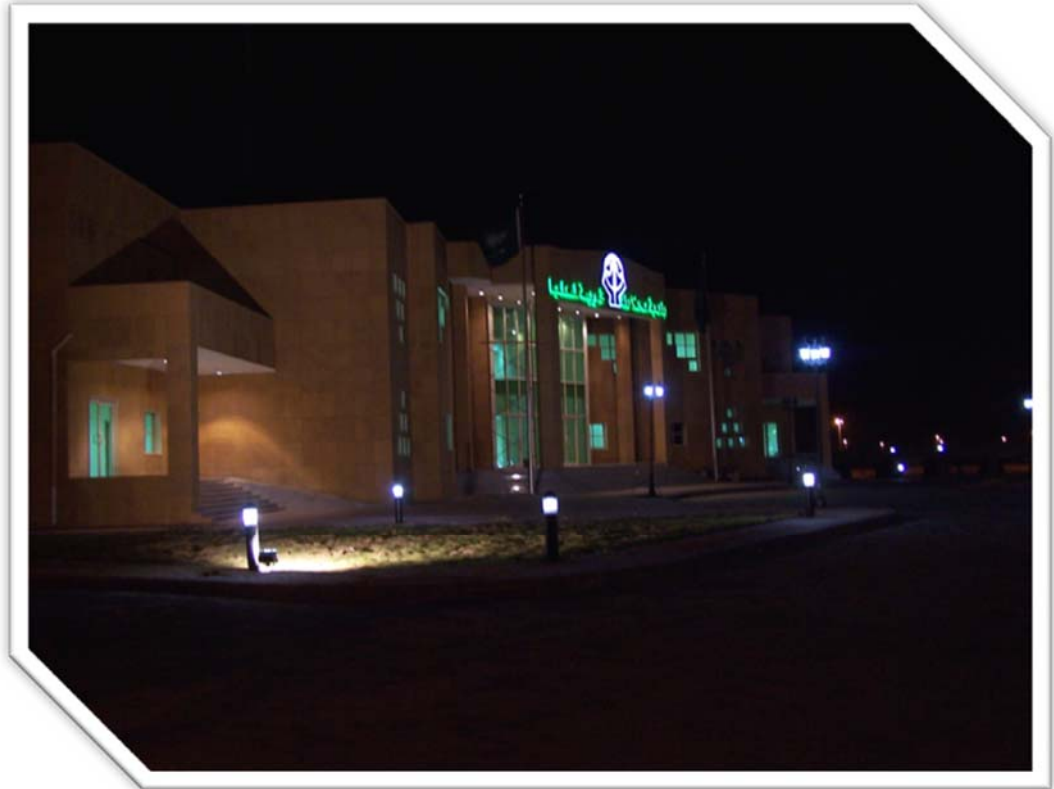
Construction of Municipality Building in Qaryat-ul-Olaiya.