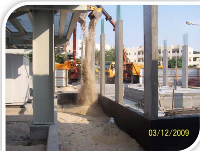
CONSTRUCTION OF SWITCHGEAR ROOM