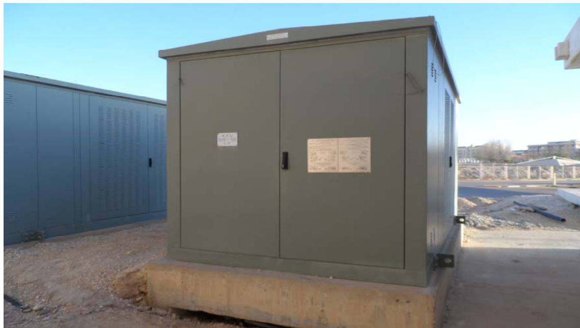
SWICHGEAR AND SUBSTATION