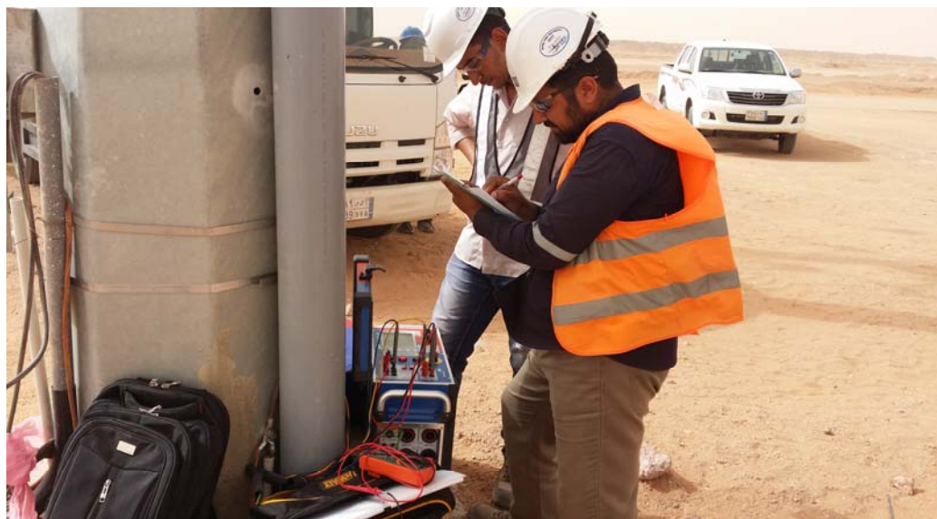
OVER HEAD TRANSMISSION LINE TESTING