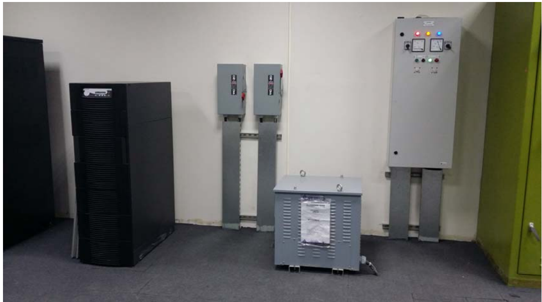
UPS AND DC BATTARIES BANK