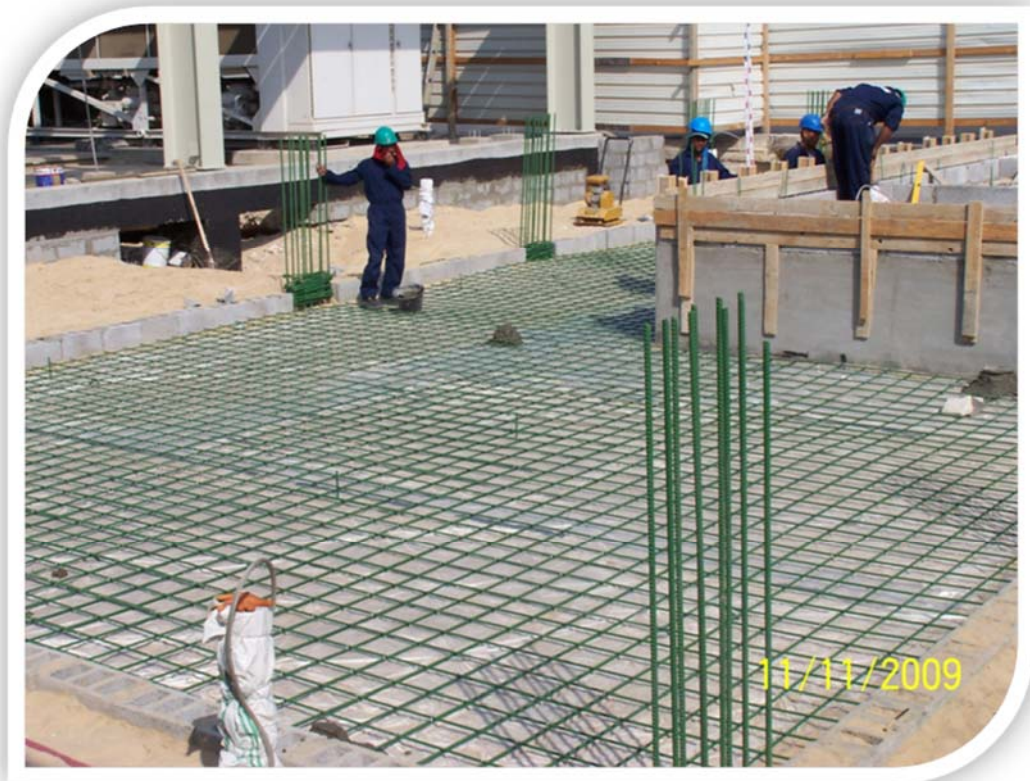
CONSTRUCTION OF SWITCHGEAR ROOM