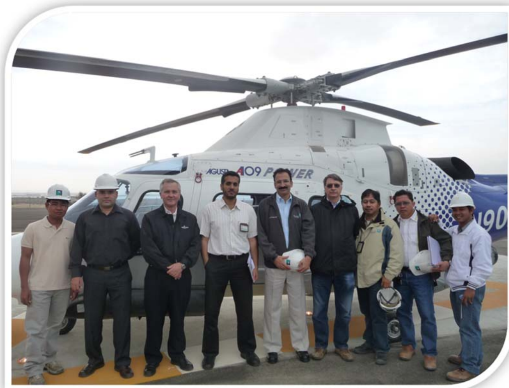
Supply, installation, Testing & Commissioning of Helipad Lighting & Control System at Aramco Site in Manifa.